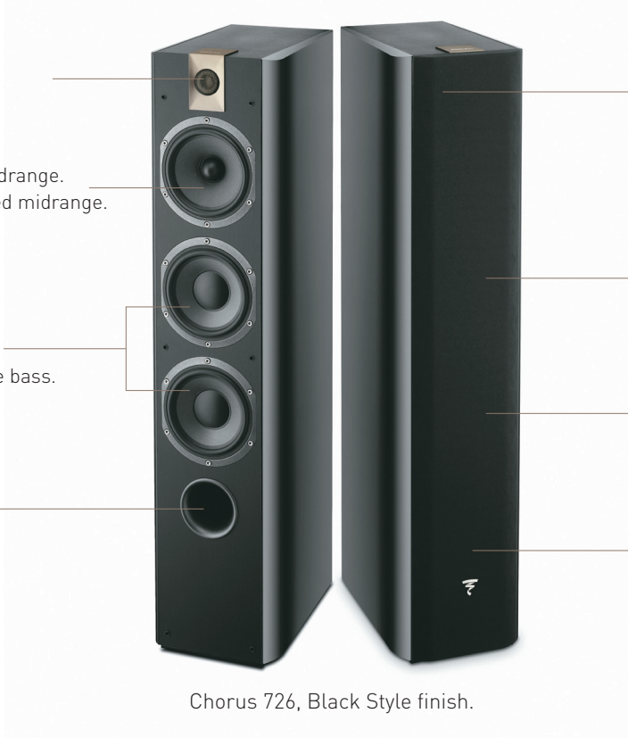
Chorus 726, Black Style finish.

New grille cloth design Better integration