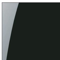
Black High Gloss