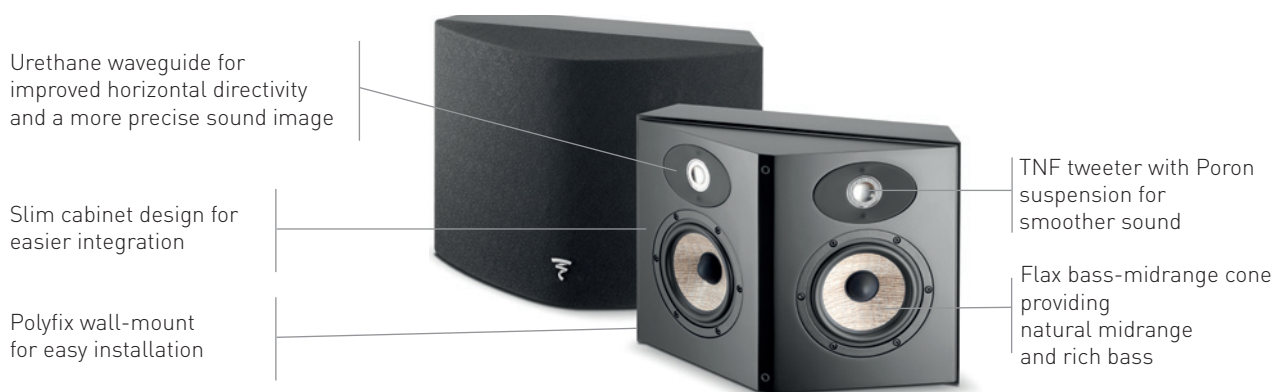
Aria SR900 Black Satin

Aria SR900 is a 2-way bipolar surround loudspeaker with the same acoustic characteristics as the other loudspeakers in the Aria range. Composed of two 5" (13cm) woofers with Flax sandwich cones, it provides very high-definition and natural sound. For the treble register, there are two aluminium/magnesium inverted dome tweeters with Poron suspension and a waveguide for a better control of directivity. Thanks to the Polyfix wall-mounting system provided, the compact SR900 loudspeaker is easy to integrate into your interior.