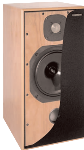
Compact 7ES-2: cut-away of SuperGrille™