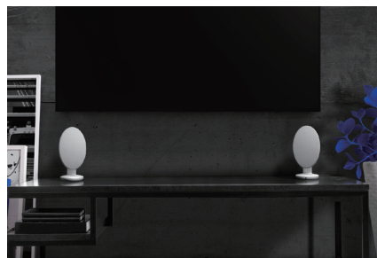
TV sound with optical connection