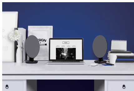
Hi-Res sound with USB 96kHz/24-bit input